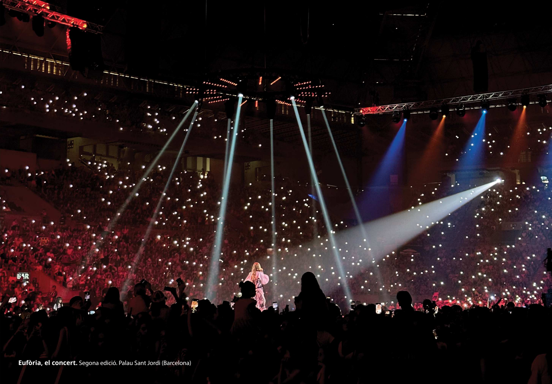
Eufòria, el concert. Segona edició. Palau Sant Jordi (Barcelona)