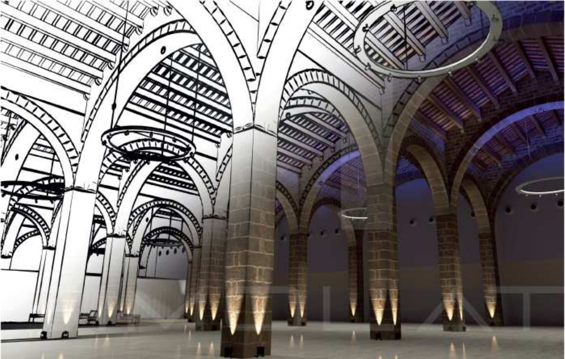
Museu Marítim de Barcelona. Sala Gran. Hyper-realistic BIM based render. SimolatAV®