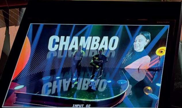
Col·lapse. Segona temporada. Estudis centrals de TV3