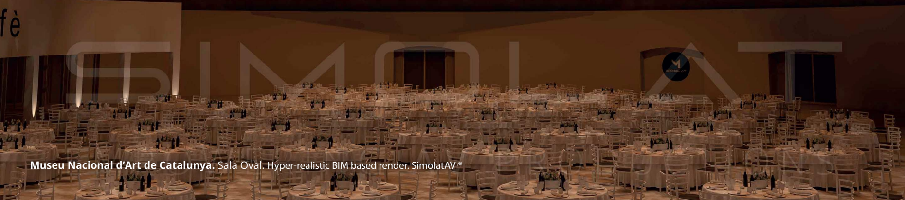
Museu Nacional d'Art de Catalunya. Sala Oval. Hyper-realistic BIM based render. SimolatAV®