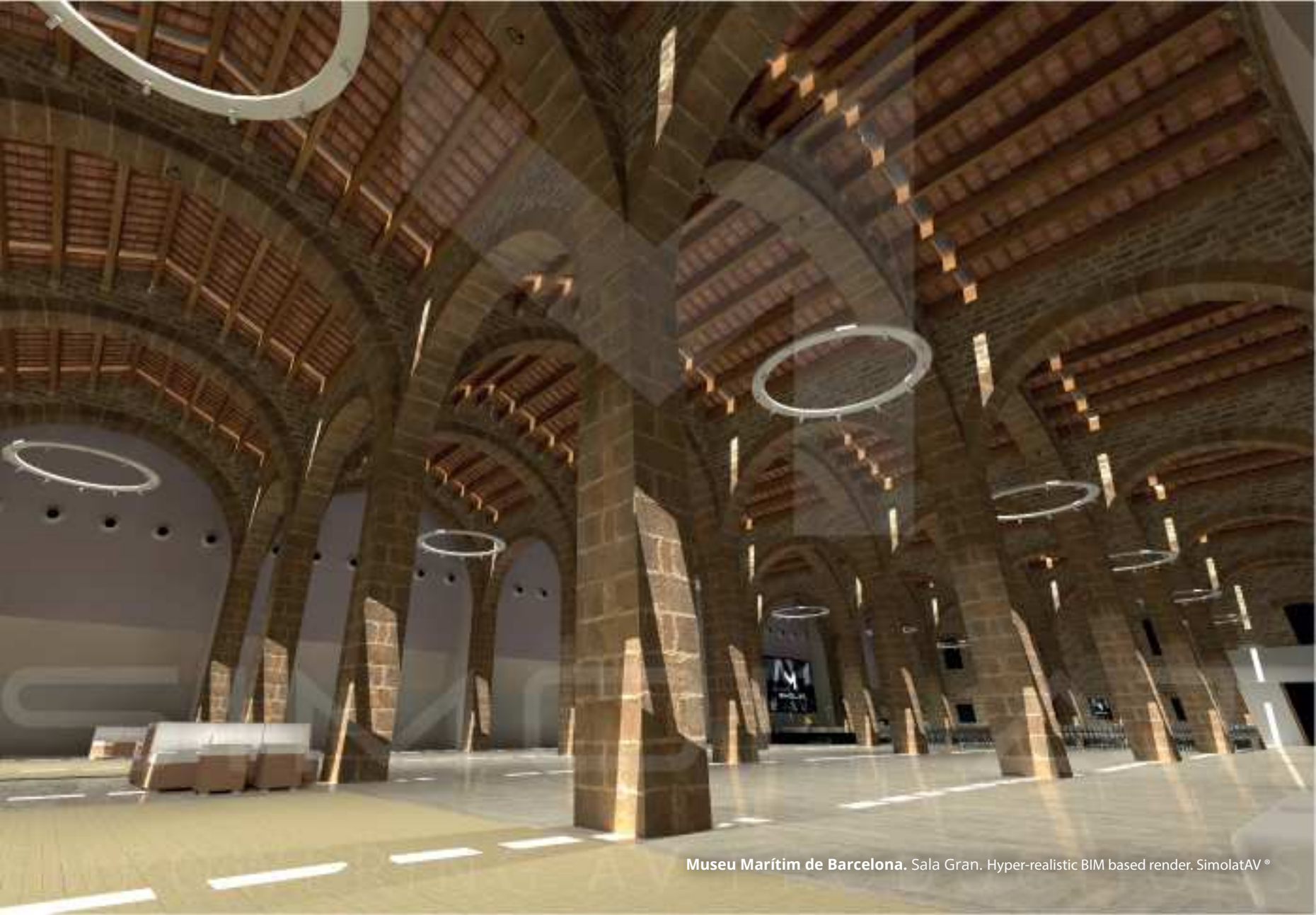
Museu Marítim de Barcelona. Sala Gran. Hyper-realistic BIM based render. SimolatAV®